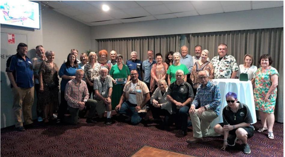
19 th November 2022 Club Members at the Annual Dinner Algester Sports Club Celebrating the 40 th anniversary of the foundation of the club.

A PUBLICATION OF THE VOLKSWAGEN DRIVERS CLUB OF QUEENSLAND