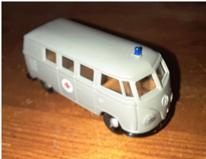
Brekina VW Ambulance. Superb detail in only 4cm long!