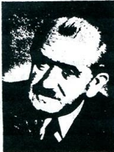
DR. FERDINAND PORSCHE

The man who creater-designed, developed and built it was Ferdinand Porsche (1875-1951).