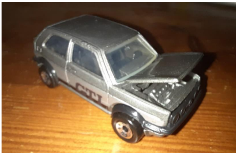
1985 Matchbox 1:58 scale Golf GTI.

Not up to the high standard of most Matchbox vehicles but interesting nevertheless.