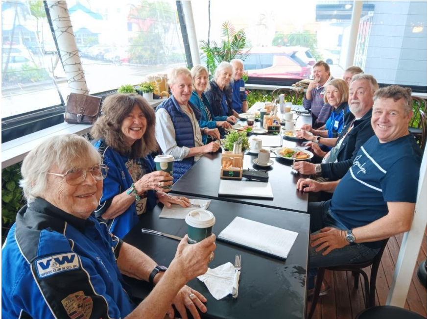
Breakfast at the Chillax Café Daisy Hill on Saturday 25 th May 2024 The Volkswagen Drivers Club of Queensland Incorporated

A PUBLICATION OF THE VOLKSWAGEN DRIVERS CLUB OF QUEENSLAND