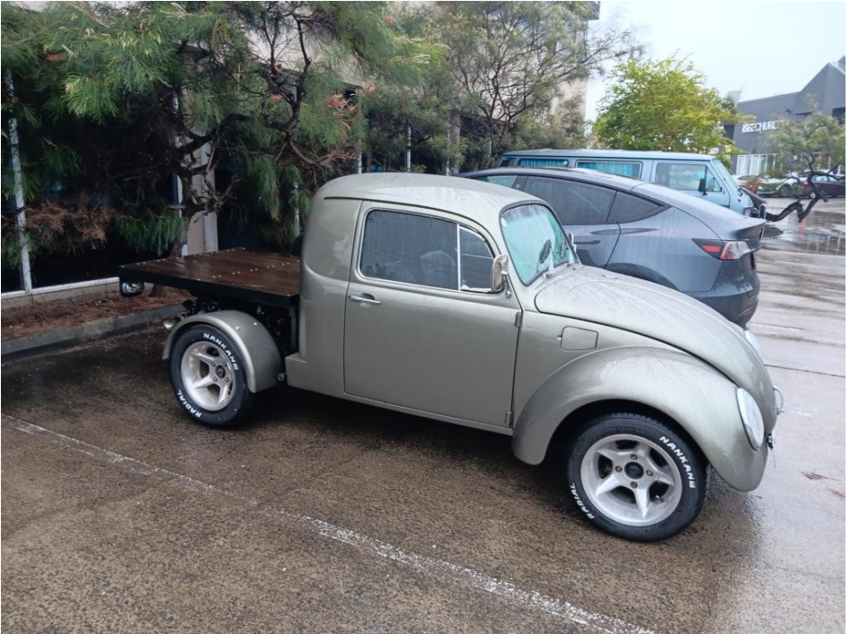
Beetle versus Kombi Flat tops