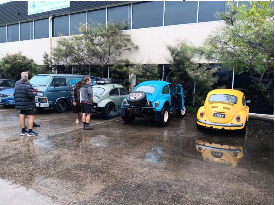
The Baja Bug set didn't let the wet weather spoil their day.