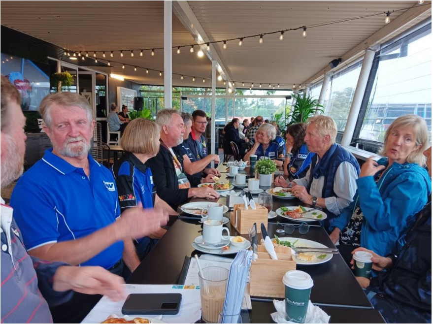
Animated conversations at the Chillax Meeting on Saturday 25 th May.