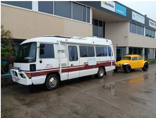
Another view of Wally Penboss' Camper/Beetle pairing

Following the breakfast the hardy Baja souls were off to the sands of Noosa which if it kept raining were likely to be quite firm but the dunes tricky in places. Those of us still drinking coffee wished them well and were not envious!