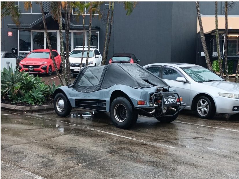
A well-presented Beach Buggy sheltering from the rain